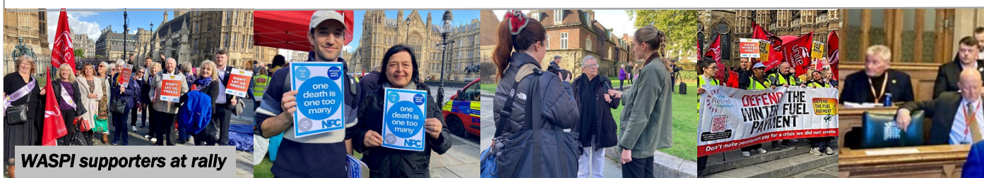
WASPI supporters at rally

All our speakers encouraged us all to keep lobbying local MPs and Ministers to bring back universal WFP as a matter of urgency.