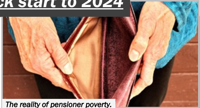
The reality of pensioner poverty.

JRF define poverty as having household earnings below 40% of the UK median income after housing costs. This means most would have to double their income to just make ends meet. With older people largely on low and relatively fixed pensions we have little chance of doubling our income, particularly as prices continue to rise, and the Triple Lock protecting future state pension increases