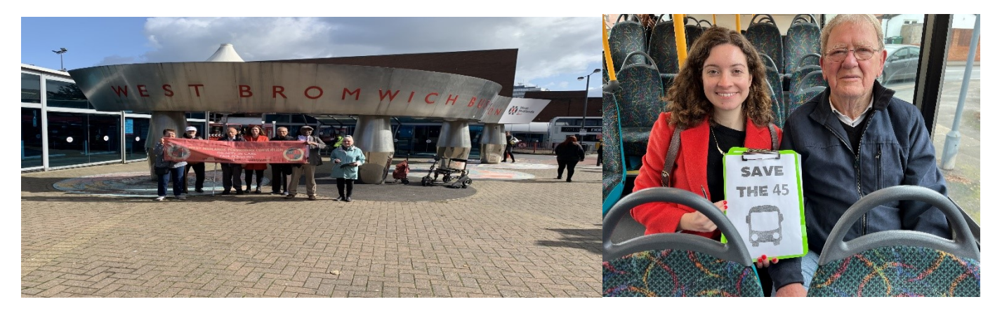
Campaigners for a better bus service at West Bromwich Bus Station the successful campaign to save the 45 Bus.

The Conservative Government deregulated bus services across the UK in the mid 1980's, resulting in State and Municipally owned bus operators being taken out of Local Authority control and handed over to the private sector. We were told by Prime Minister Margaret Thatcher that privatising our bus service would lead to lower fares, more bus routes and growing passenger numbers.