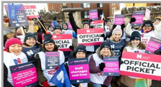
Nurses will be among striking NHS workers on 6/7 Feb