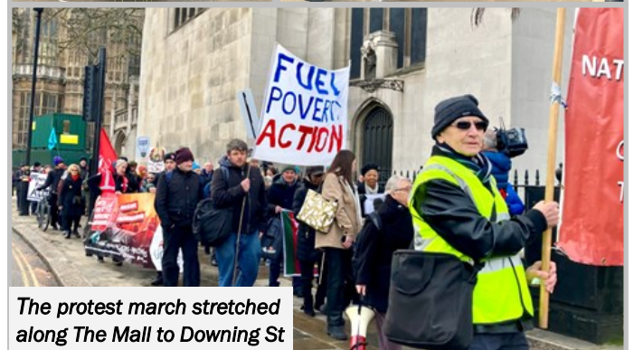
The protest march stretched along The Mall to Downing St

we will be calling for review of the accuracy of the figures, which given the recent national/UK stats for excess deaths seem rather low. That said, the numbers dying from cold related illness in the UK in this day and age is shameful.