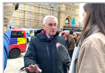
ITN interview John McDonnell

The government needs a new vision and a new plan to show people across this country that they can have a living wage, and a living pension to enable them to pay their bills and have a decent standard of living.”