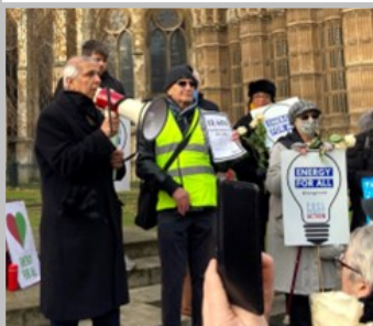
Lord Sikka (left) addresses demo

The National Pensioners’ Convention, was joined at Westminster by Fuel Poverty Action, the End Fuel Poverty Coalition, Disabled People Against Cuts (DPAC) and many others to hold a minute’s silence outside Parliament at 12pm. Afterwards they marched to Downing Street with a coffin bearing the number of those who have died.