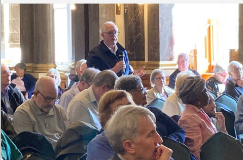
Members put questions to the panels.

The audience heard speakers warn how our oldest and most vulnerable are facing increasing hardship in the face of soaring prices and growing ageism. Keynote speaker Lord George Foulkes, the Joint Chair of the All Party Parliamentary Group for Ageing and Older People, said it was time that England and Scotland had dedicated advocates for pensioners’ rights, as they have in