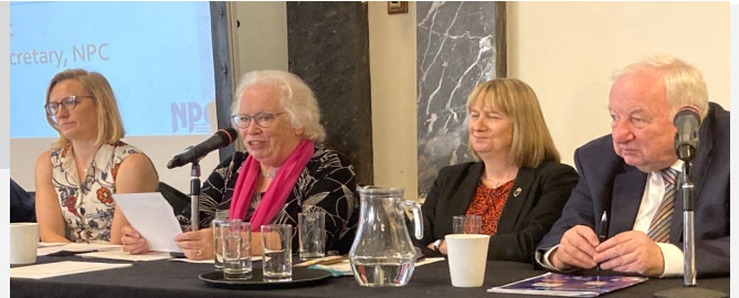
Lively panel discussions were popular with members